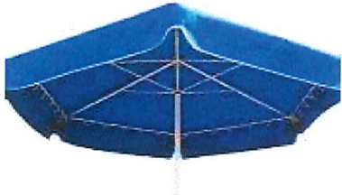
TF3305 Classic Durabrella 8' Round with Valance