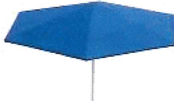
TF3306 Market Style Umbrella 8' Round without Valance