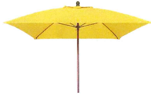
TF3319 6' (72") Square Push-Up with Pin

Available pole color options: White, Champagne Bronze, Black