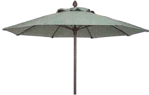
TF3316 7.5' (90") Octagonal Push-Up with Pin