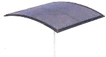
TF3307 Contemporary Curve Umbrella 6' (72") Square

Available pole color options: Several standard frame/pole colors available, can be powdercoated in any RAL color